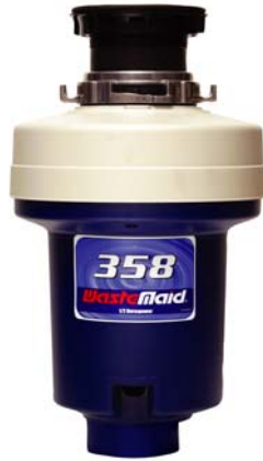
1/2 HP HEAVY DUTY