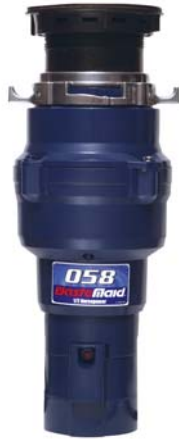
1/2 HP ECONOMY